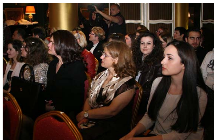
Forumi i Grave Francophon, 20 Mars 2017