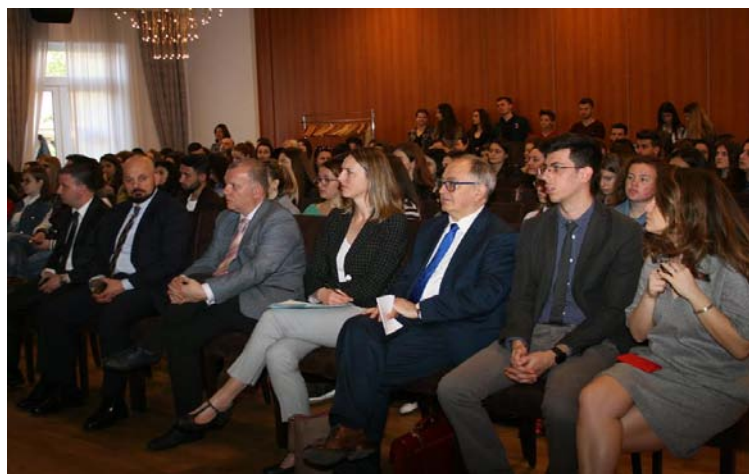
Forumi i 3-Te Ekonomik Francophon ne Shqiperi, 23 Mars 2017