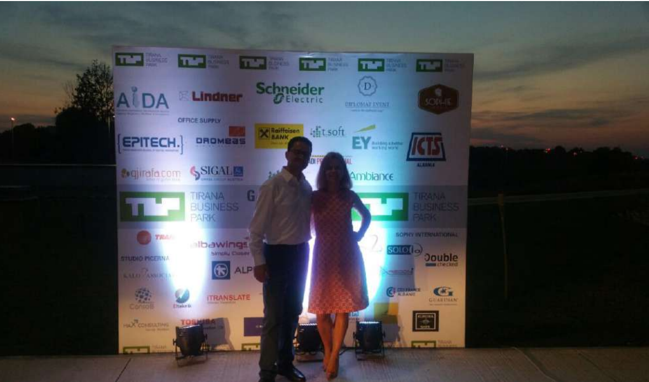
Logo of our Chamber & successful companies in Albania....